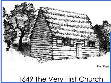
1649 The Very First Church

Now it's Our Turn to provide for those who follow us.